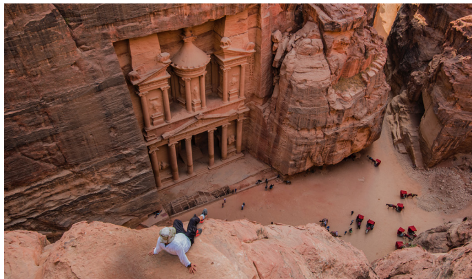
The Treasury, Petra